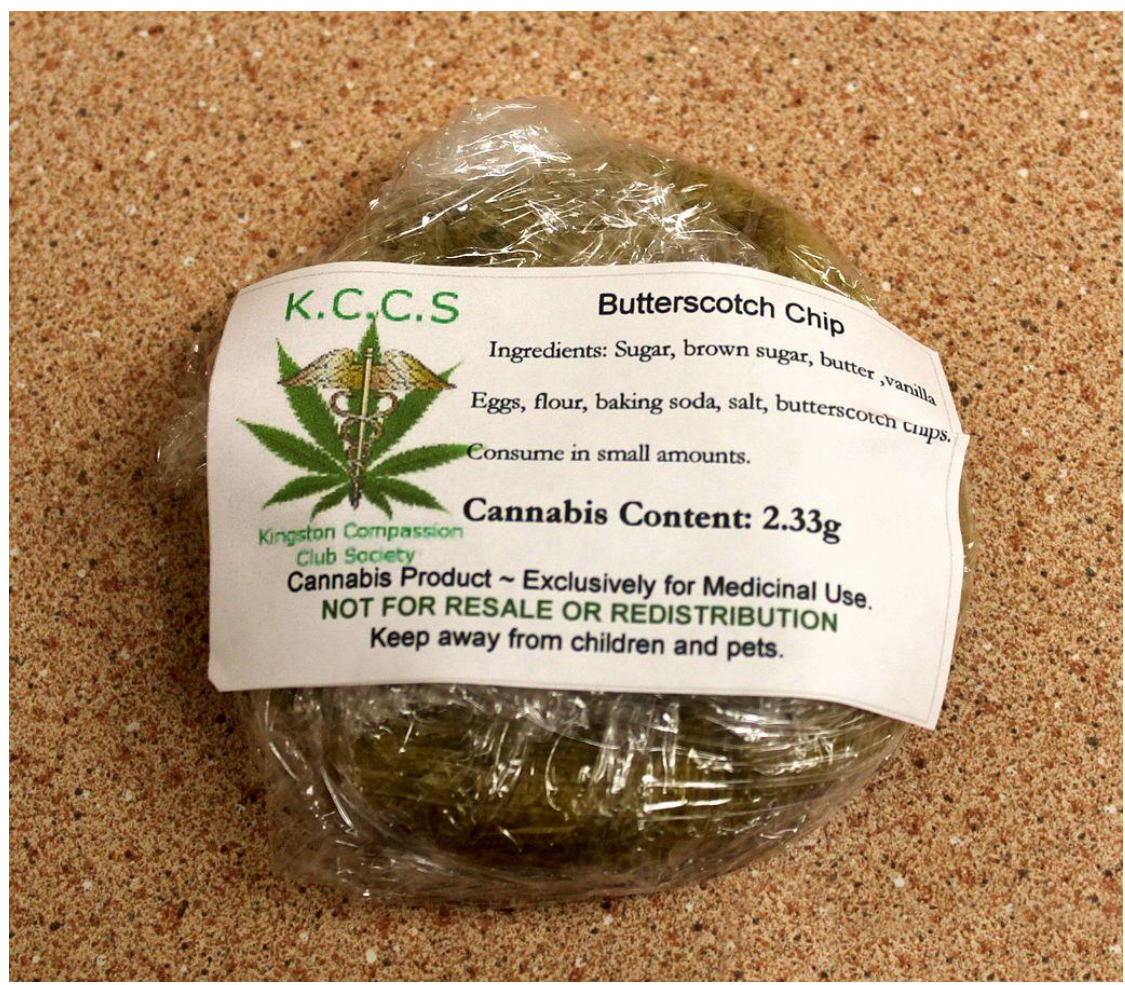
MARIJUANA COOKIE W/LABEL<sup>24</sup>

A subset of edibles includes "adulterated" food or drink products. These are food products which existed without marijuana in a form ready for consumption to which marijuana was subsequently added. For example, candy bars or Gummy Bears sprayed down with a marijuana concentrate and then repackaged and sold.