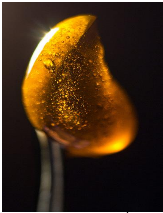
BUTANE HASH OIL<sup>18</sup>

This extraction method has generated significant controversy. Individuals who attempt to extract hash oil in their homes often use butane, which is easy to procure, but is also a volatile flammable gas. In an uncontrolled environment (such as the home), butane hash oil extraction can lead to fires and explosions. It is important to note that the danger lies in the extraction method (using butane), not the product of the extraction (hash oil), which itself is not volatile.