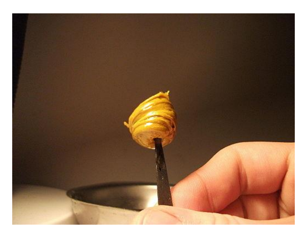
BUTANE HASH OIL "HONEY"19