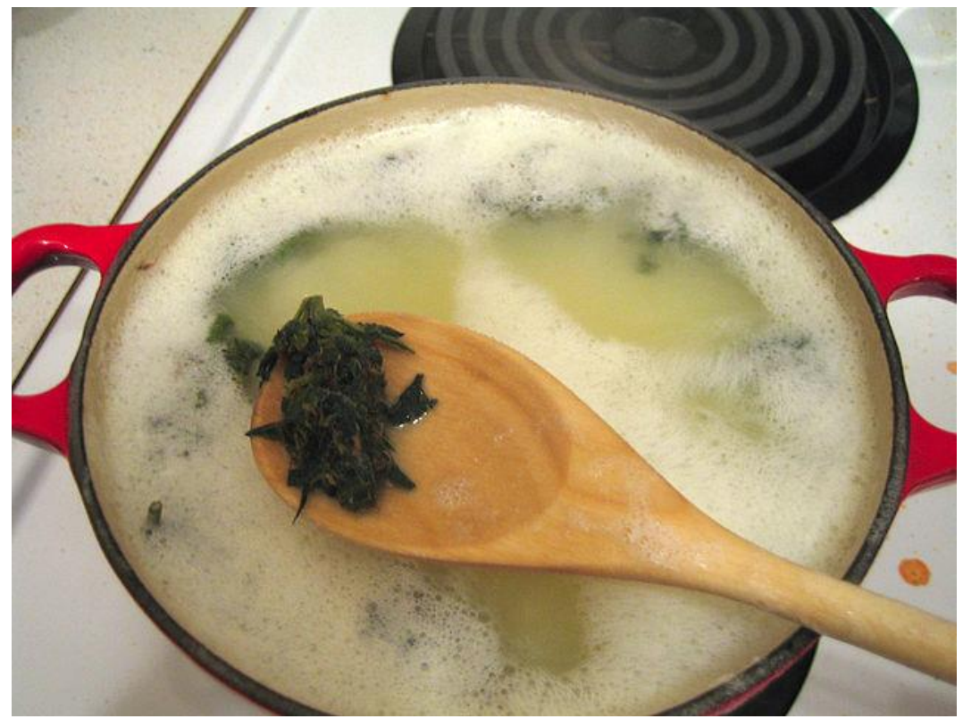
MAKING MARIJUANA BUTTER<sup>21</sup>

In short, concentrates are typically made either by removing and collecting the trichomes from the flower/bud; or by dissolving the flowers/buds into a solvent thereby extracting the THC. The resulting product has a very potent THC count and can take many forms, including a powder, a solid brick, a liquid, or a viscous oil.