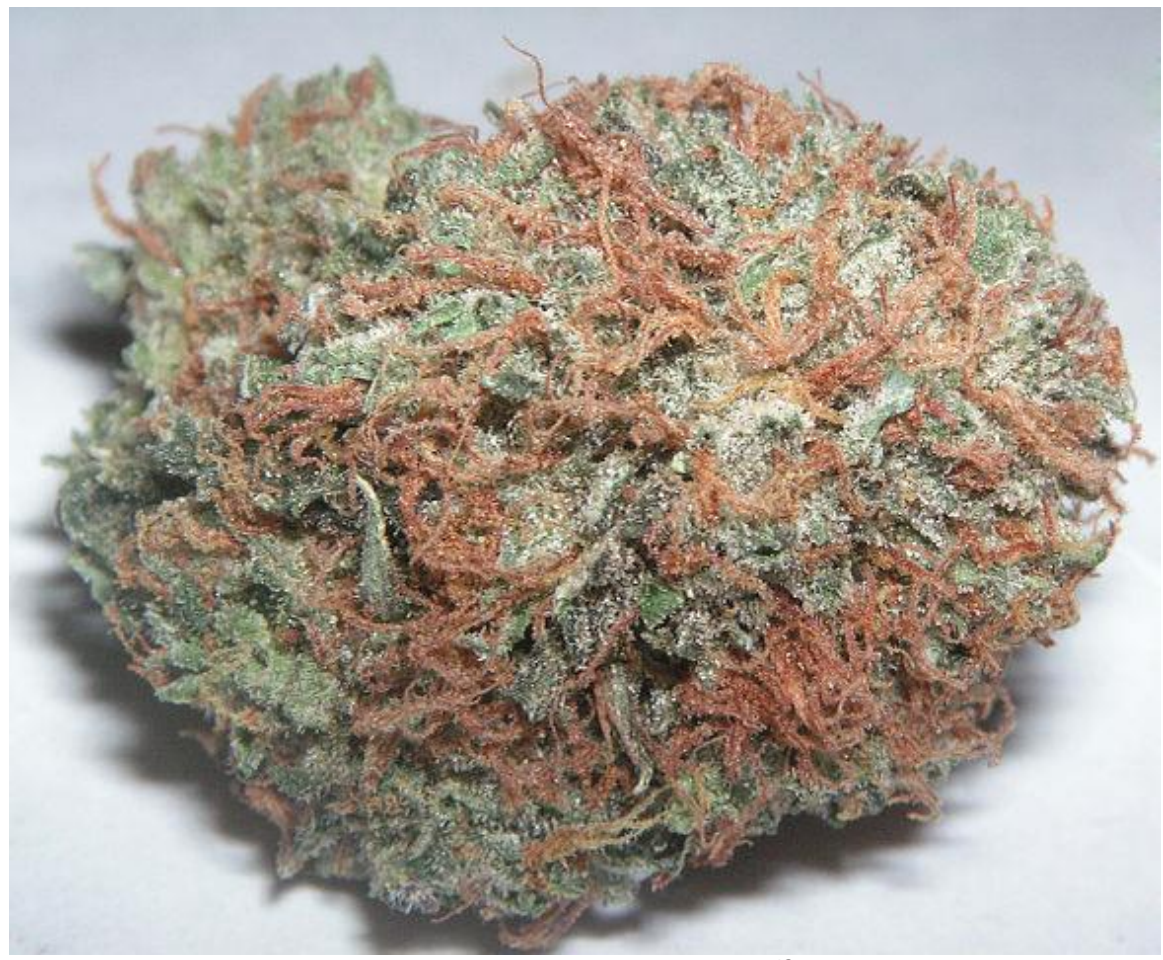
DRIED MARIJUANA FLOWER/BUD<sup>13</sup>

As the rate of consuming marijuana by smoking marijuana flower has decreased, consumption of marijuana derivatives called "concentrates" has increased. Concentrates have gained in popularity because they offer a more potent consolidation of THC than the traditional flower buds. The main forms of marijuana concentrates are: