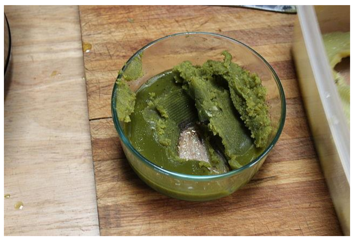
MARIJUANA BUTTER INFUSION<sup>22</sup>

There are three main ways in which marijuana concentrates are consumed: eating, "vaping," or "dabbing."